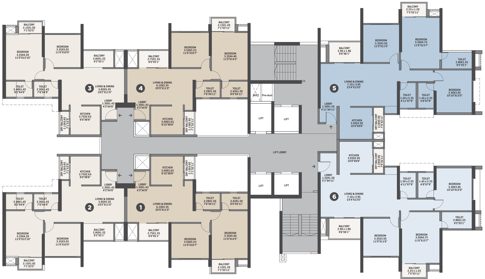
TOWER-2 Typical Floor Nos. - 2, 3, 4, 6, 7, 8, 9, 11, 12, 13, 14, 16, 17, 18, 19, 21, 22, 23, 24, 26, 27, 28, 29, 31, 32 & 33