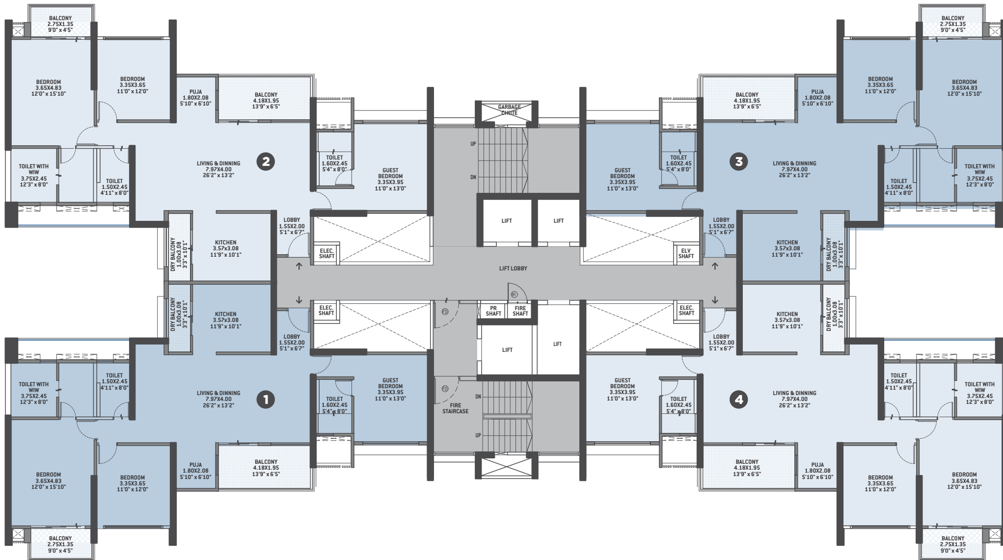
TOWER-4 Typical Floor Nos. - 2, 3, 4, 6, 7, 8, 9, 11, 12, 13, 14, 16, 17, 18, 19, 21, 22, 23, 24, 26, 27, 28, 29, 31, 32 & 33