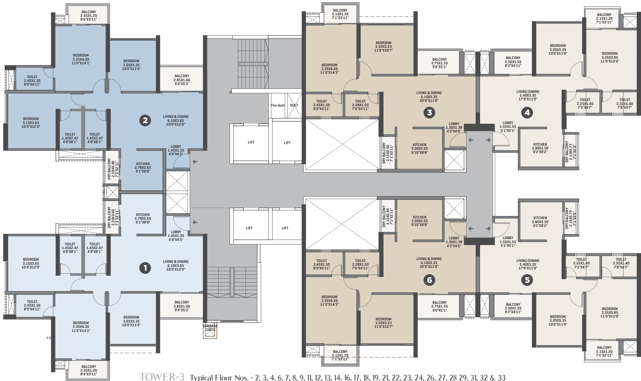
TOWER-3 Typical Floor Nos. - 2, 3, 4, 6, 7, 8, 9, 11, 12, 13, 14, 16, 17, 18, 19, 21, 22, 23, 24, 26, 27, 28, 29, 31, 32 & 33